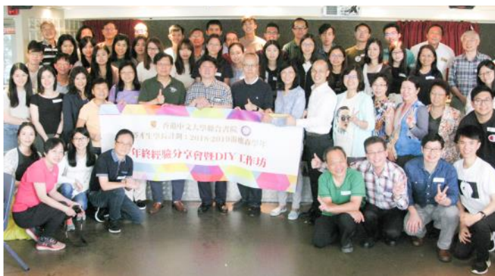
大合照。 Group photo.

To strengthen the relationship between mentors and mentees in the United College Shum Choi Sang Mentorship Programme, a year-end gathering cum DIY workshop was held on 11 May 2019 at the United College Si Yuan Amenities Centre. Activities included DIY heat-shrink ornaments, presentation of certificates to mentees and gifts to online survey participants, experience sharing and afternoon tea. Around 60 mentors and mentees exchanged their views on how the programme could be carried out better at the gathering.