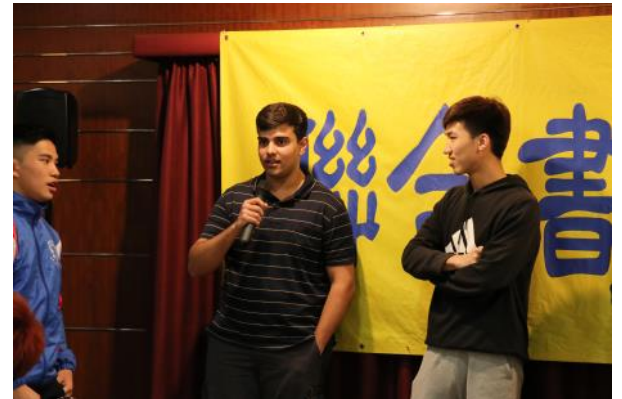
遊戲環節。 Game Section.