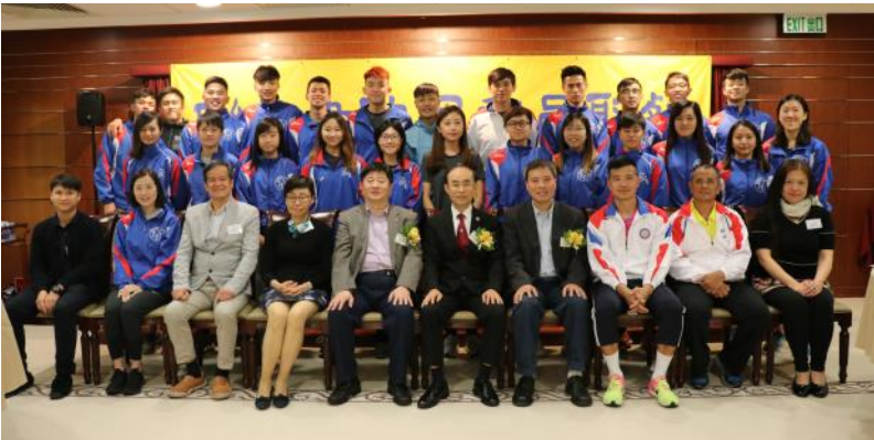
聯合書院體育學會同學與嘉賓在晚宴上大合照。 A group photo of the guests and United College Sports Association members at the Dinner.