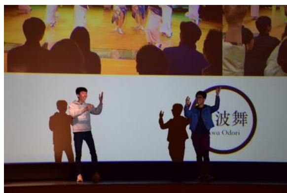
服務體驗實習計劃（日本德島市）的同學分享他們的體驗。 Students of Service Learning Internship Programme (Tokushima City, Japan) shared their experience.