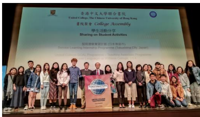
大合照。 A group photo.