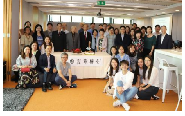
大合照。 Group Photo.