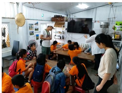
▲ 同學協助舉辦環保的工作坊。 Students assisted the organization of a workshop on environmental protection.