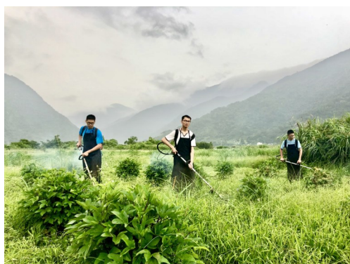
▲ 同學於南澳自然田進行除草的工作。 Students helped to weed.

The College Service Learning Internship Programme (SLIP) was held in this summer. Six students joined the service-learning programme in non-profit making organisations in Taiwan. Three of them joined Nanao Natural Farm for about three weeks. During the period, students increased their knowledge on organic farming such as the method to rely on ecological management and to produce crops in an environmentally friendly and sustainable manner. This enabled them to reflect on the relationship between human and nature.