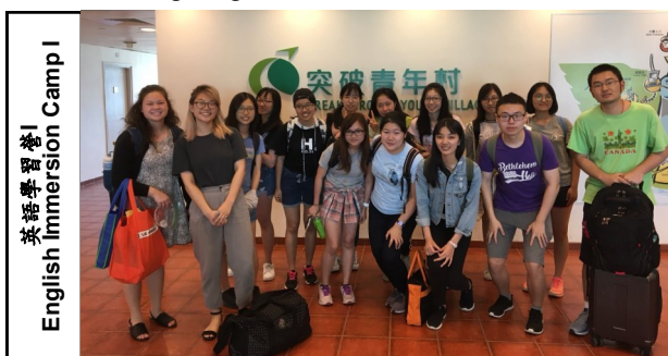
▲ 日期：2018年5月18至20日 Date: 18 to 20 May 2018 地點：突破青年村 Venue: Breakthrough Youth Village

With the objective of enhancing students' language proficiency, the College organised two summer English Immersion Camps in May 2018. The three-day summer camps provided students with a good learning environment and a variety of interesting activities, through which students could enhance their language proficiency and confidence in using English. Students also benefit from making new friends and expanding their social circle.