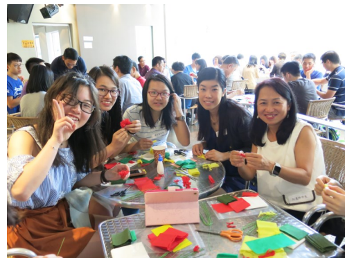
▲ 學長和學員一起制作康乃馨手工紙花。 Mentors and mentees making crepe paper carnations together.