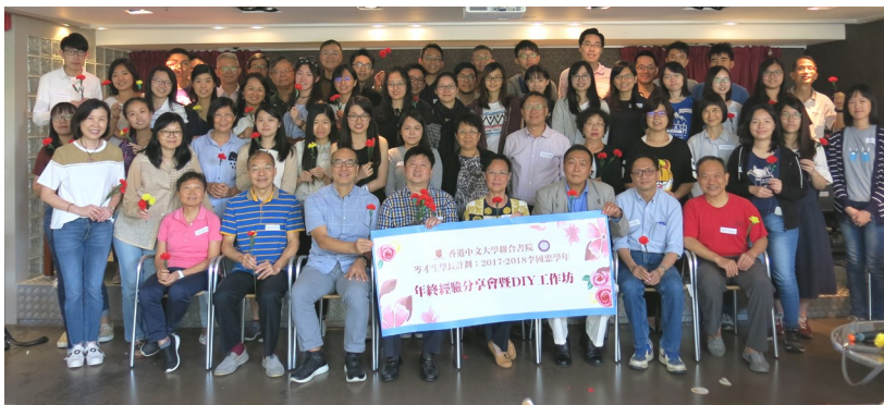
▲ 全體大合照。 Group photo.

To strengthen the relationship between mentors and mentees in the College Shum Choi Sang Mentorship Programme, a year-end gathering cum DIY workshop was held on 12 May 2018 at the College Si Yuan Amenities Centre. Activities included making crepe paper carnations, presentation of certificates to mentees, sharing of experience and afternoon tea. Over 60 mentors and mentees exchanged their views on how the programme could be carried out better at the gathering.