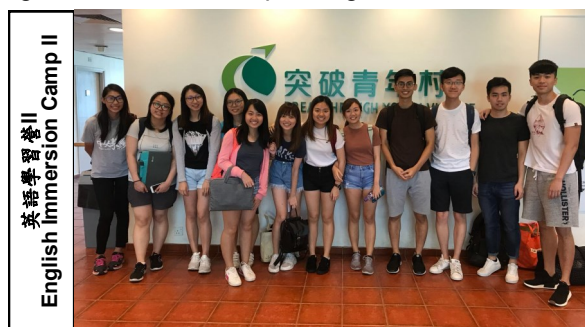
▲ 日期：2018年5月25至27日 Date: 25 to 27 May 2018 地點：突破青年村 Venue: Breakthrough Youth Village