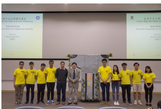
▲ 2014年級社同學代表畢業班致送紀念品予書院。 A souvenir was presented to the College by the 2014 Class Society on behalf of all graduating students.