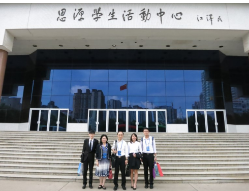
▲ 聯合訪問團合照。 Group photo of UC delegation.