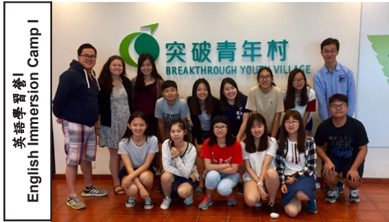
▲ 日期：2017年5月12至14日 Date: 12 to 14 May 2017 地點：突破青年村 Venue: Breakthrough Youth Village

To enhance students' language proficiency, the College organised two summer language immersion camps in May 2017. The three-day summer camps offered a variety of interesting activities and helped the participants to gain confidence in learning and using English. It also provided participants an opportunity to make new friends and expand their social circle.