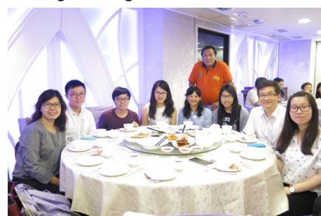
▲ 學長和學員一起享用下午茶。Participants enjoyed the afternoon tea.