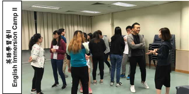
▲ 日期：2017年5月26至28日 Date: 26 to 28 May 2017 地點：突破青年村 Venue: Breakthrough Youth Village