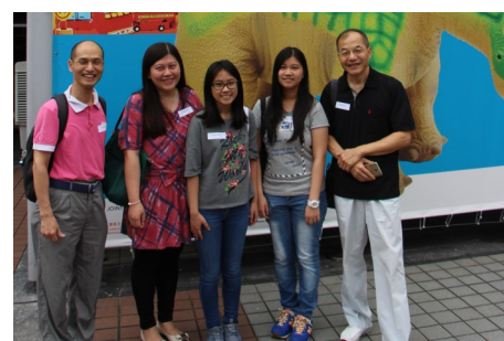
▲ 小組成員在香港歷史博物館留影。Group members took a picture at the Hong Kong Museum of History.