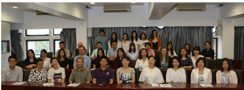
▲ 香港中文大學（深圳）的代表來訪書院。 A delegation from CUHK (Shenzhen) visited the College.