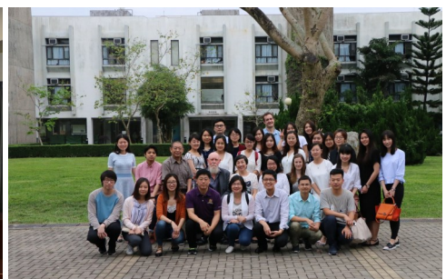
▲ 訪問團於湯若望宿舍前合照。 Group photo taken outside the Adam Schall Residence.