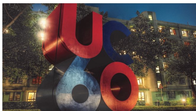
▲ 季軍：光輝六十年；葉浚昇（文化及宗教研究/二） Third Prize: The Great Sixty; Yip Tsun-sing (RELS/2)