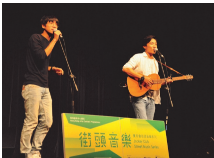
▲ 《新青年理髮廳》表演。 Performance by the Band "New Youth Barber Shop".