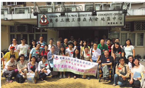
▲ 學長和學員在探訪獨居長者前與東華三院王澤森長者地區中心職員合照。Mentors and mentees posed a group photo with staff of the TWGHs Wilson T S Wang District Elderly Community Centre before departing for home visits.