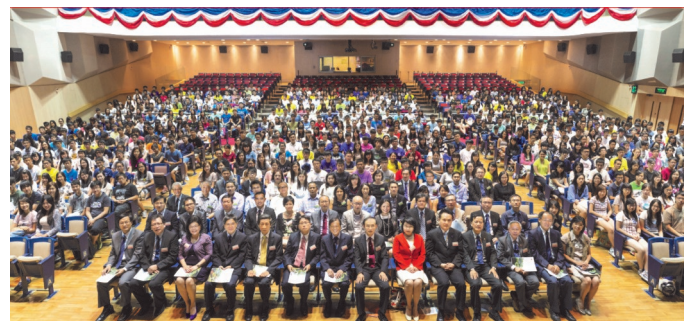
▲ 所有出席書院新生開學典禮的嘉賓及學生在邵逸夫堂內合照留念。 A group photo for all participants was taken at the Initiation Ceremony for Freshmen at Sir Run Run Shaw Hall.