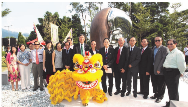
▲ 聯合書院一眾嘉賓於雕塑前合照。 Group photo of UC members in front of the sculpture.