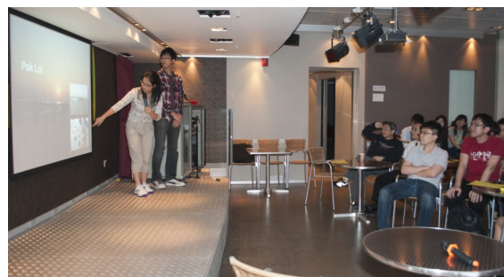
▲ 專題研習小組活動分享。 Experience sharing of focus learning group.