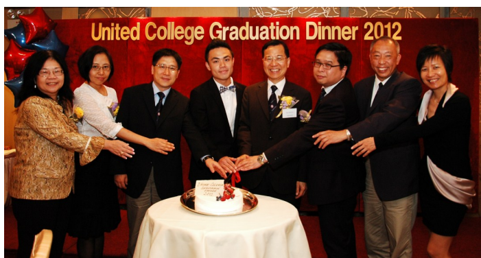
The Graduation Dinner organised by the 2009 Class Society was held on 15 May 2012 at Royal Garden Hotel, Tsim Sha Tsui. A total of 110 fresh graduates and guests attended the dinner, including College staff.

由 2009 年級社《牽聯社》籌辦的 2012 年畢業晚宴已於 5 月 15 日假尖沙咀帝苑酒店舉行。當晚共有一百一十位應屆畢業同學及嘉賓蒞臨晚宴，書院同仁亦有出席。