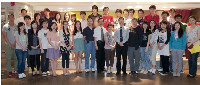
▲ 參與計劃的老師、宿舍住校導師和同學。 Teaching staff, resident tutors and students who joined the scheme.