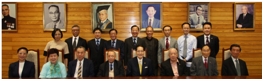
◀ 6月7日與校董會面 Forum for UC trustees on 7 June