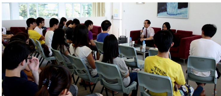
▲ 5月23日與學生會面 Forum for UC students on 23 May