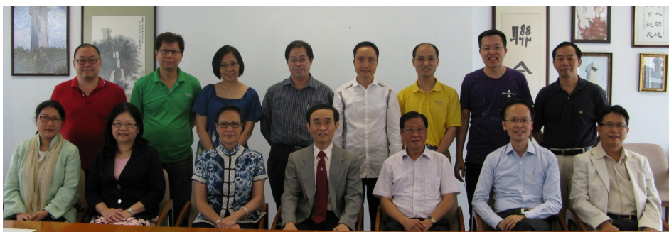
6月2日與校友會面 Forum for UC alumni on 2 June