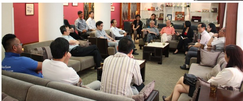
▲ 5月23日與教職員會面 Forum for UC staff on 23 May