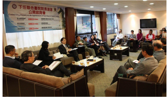
教職員公開諮詢會 Consultation forum with all staff

未有出席諮詢會的教職員、學生及校友，歡迎以 Facebook： http://www.facebook.com/UC.next.Head 或透過聯合書院院務主任李雷寶玲女士(電郵： christina-li@cuhk.edu.hk )表達意見。