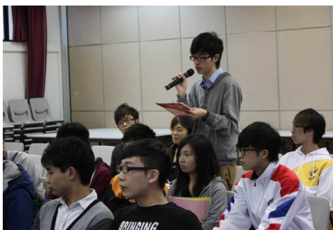
學生公開諮詢會 Consultation forum with all students