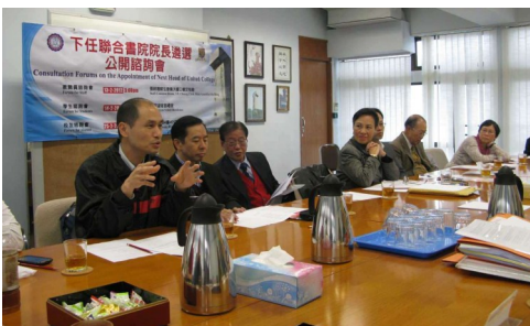
校友公開諮詢會 Consultation forum with all alumni