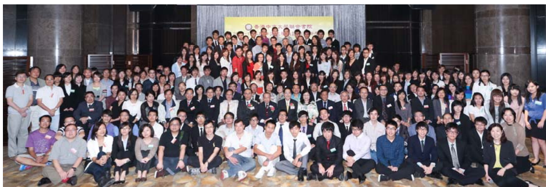
◀ 本屆學長及學員與嘉賓大合照。 Group photo of guests with mentors and mentees.