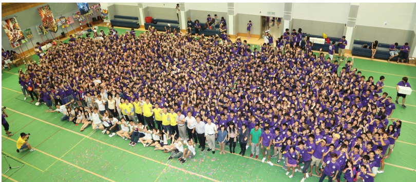
▲ 書院校友會代表、大學及書院行政人員出席書院新生輔導營開幕典禮。 Representatives of the College Alumni Association, University and College administrative staff attended the Opening Ceremony of the College Orientation Camp.