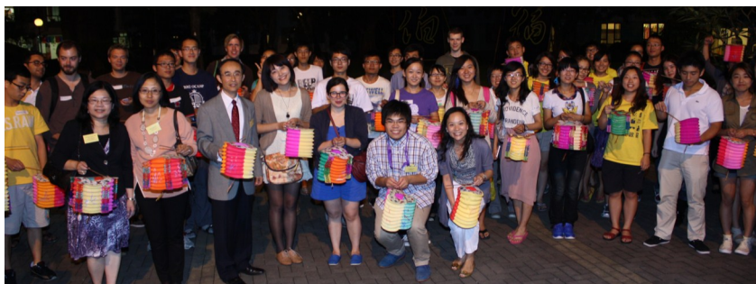
▲ 同學們於晚宴後提燈遊書院。 Students joined a lantern parade around the College campus after the dinner.

The College organised a dinner on 27 September 2012 in the student canteen to welcome the newly admitted exchange and non-local undergraduate students of the College. Over one hundred students attended the dinner.